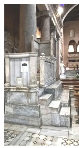
Lectern for the Epistle in San Lorenzo fuori le mura

One of the additions to this church constitutes its major section and includes two impressive lecterns, one for reading the Epistle during the Mass and one for reading the Gospel, with an enormous spiral-shaped holder for the Paschal Candle close by.