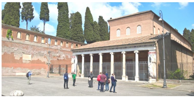
Church of St Laurence outside the walls (San Lorenzo fuori le mura)

Red is the colour of blood. I sometimes forget this. As Catholics we are blessed with a liturgical tradition which makes use of all our senses and visual colour is part of this. The different seasons have distinctive colours shown in the vestments and other features of our churches. The liturgical colour of red is used on various occasions, for example for Feasts of the Apostles, Good Friday and Palm Sunday. I was made to think about this more when I was privileged to be ordained a deacon. I wore a red dalmatic (the outer garment with sleeves worn by deacons) on the Feast of St Laurence, our own patron saint. It was then – especially – that I was reminded that martyrs shed their blood for Christ and red is the colour of blood.