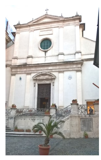
San Lorenzo in Panisperna – external view

The Via del Corso is a smart shopping street, almost a mile long, in the centre of Rome running approximately northwards from the Piazza Venezia to the Piazza del Populo. It runs close by the Italian Parliament and Prime Minister's residence, as well as major tourist sites including the Spanish Steps and the Trevi Fountain. About halfway along, in a side chapel of the church of San Lorenzo in Lucina. About halfway along is part of the gridiron on which Laurence was martyred.