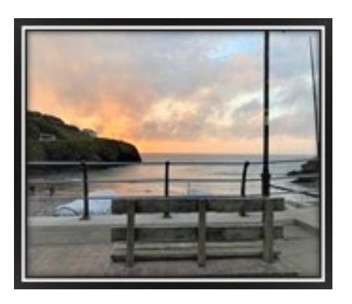
The Lizard, Cornwall