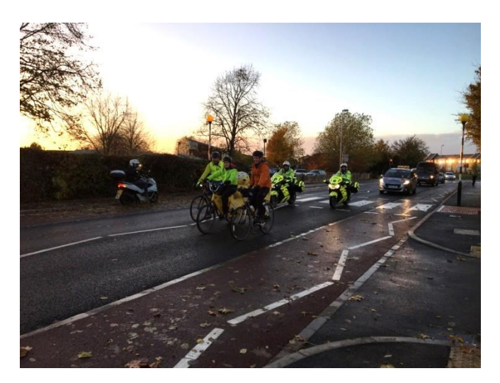
BBC Team Rickshaw Challenge passing the school

which they immediately gave to the young adults riding the rickshaw; the rest going into the whole school's total fundraising for Children in Need.